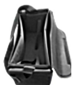
32-unit storage and distribution bag. ref. LKWLKD-CASE