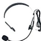
External microphone ref. WLKDT-MIC