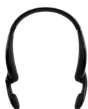
Hygienic headset Does not touch the ears! ref. TWIST